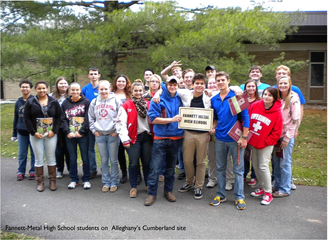
Fannett-Metal High School students on Allegheny's Cumberland site

Next, the students loaded back on to the Allegheny bus and after another hour's drive, the students had arrived at the Cumberland site. Students were quickly entranced by the great atmosphere and the large wooden clock tower located on site. Split into two groups, the high school students were shown around campus, including their automotive garage, medical simulation rooms, respiratory therapy room, and a quick peek at their on-campus housing. Then the two groups met at the lunch room and were treated to a feast of Chick-fil-A food, followed by a group picture (included below). By the end of the day, the students learned much about what Allegheny College offers, and enjoyed time reclining in the comfy bus seats. Overall the trip was a huge success!